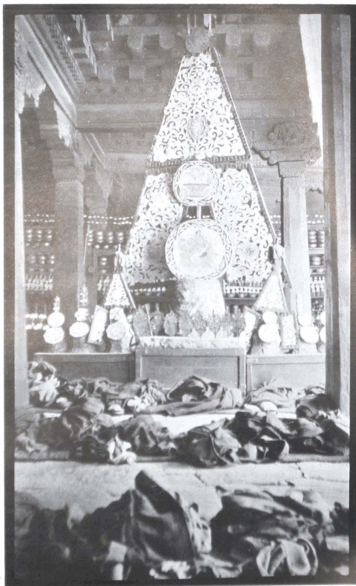
THE NEW-YEAR BUTTER TORMA IN THE JO-WO KHANG.